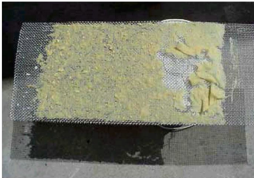
Screen of 1/8-in. Mesh Opening Obstructed by Cal-Sil (Small Yellow Lumps) and Fiberglass (Uniform Translucent Mat). Close Inspection Reveals Very Small to Microscopic Cal-Sil Granules Imbedded in a Complex Fiber Mat. The Broken Bed to the Right of the Photo Was Damaged During Screen Removal. Nominal Fiber Thickness is 1/10-in.