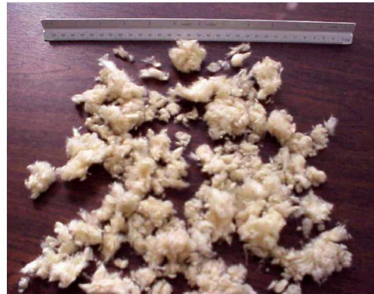
Typical Nukon fiberglass insulation debris used in transport testing.